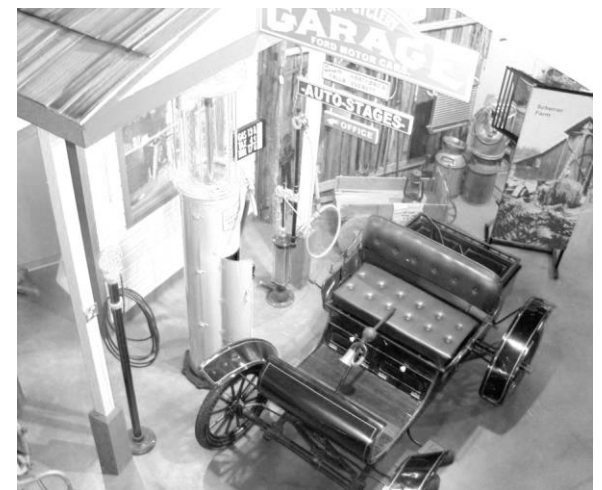
1904 Oldsmobile and garage display