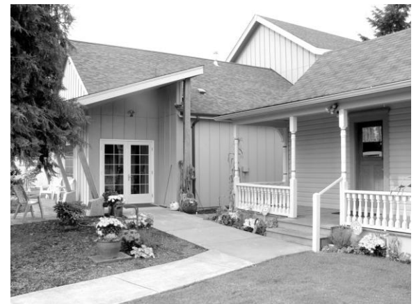
“The Little Museum that Could”