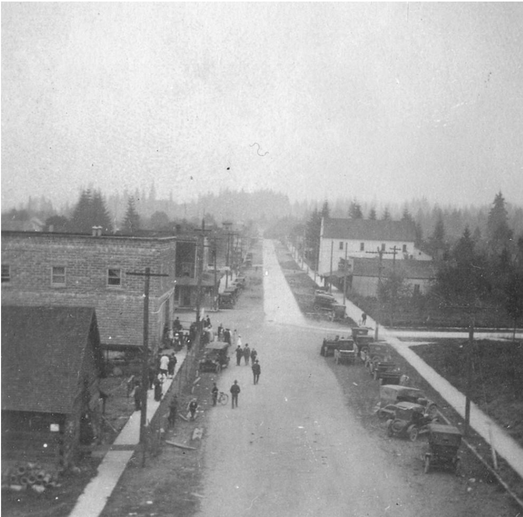
A fair was held in 1917 at the south end of Granite Falls, to help with military recruitment. You can see Union Hall at the lower left in a picture taken from the top of the ferris wheel, which was erected in the intersection of S. Granite Ave and Wallace St. Just beyond it is the IOOF Hall, while further north on Granite Ave is the white two-story building that is Legion Hall today. Notice the newly-installed pavement on S. Granite Ave (main street in town) and Pioneer St (leading to Waite Mill, largest area employer).