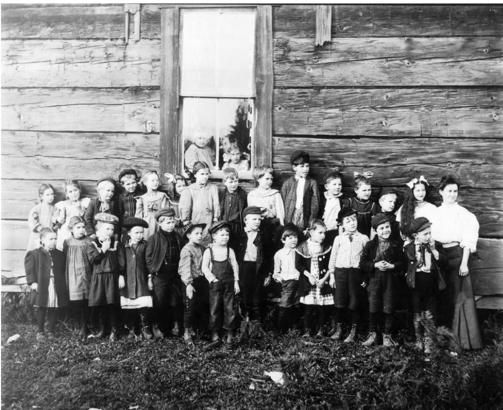
Constructed of heavy timbers, each squared-off log dwarfed the students. It was located just south of the International Order of Odd Fellows (IOOF) Hall, which for decades was Konnerup's Store, and in 2014 is Our Father's House Church.