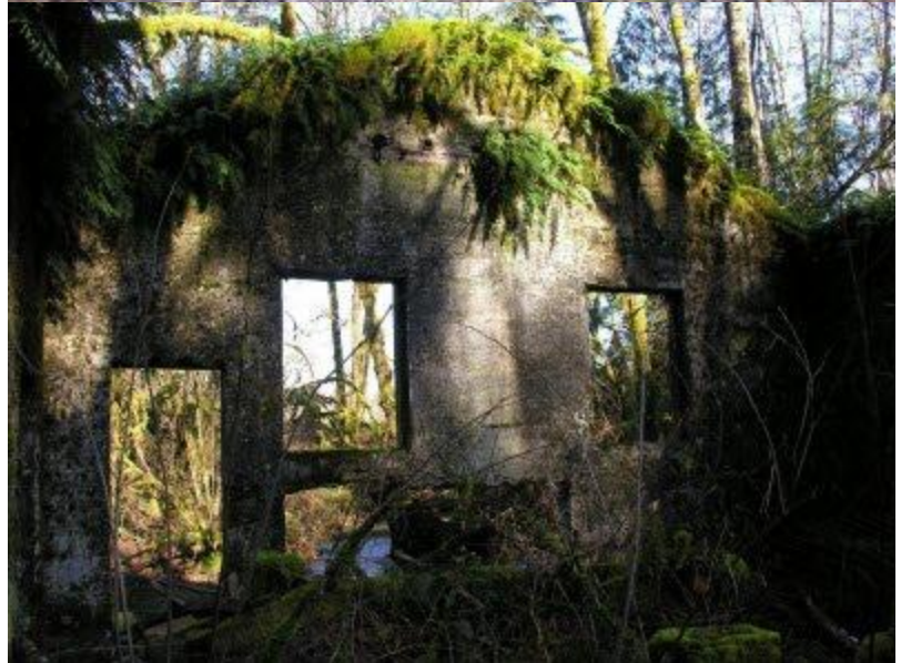
Not much is left on Coon Creek except the dam (the lower three feet of the spillway was removed in 1983 to allow fish passage) and the shell of the power house.